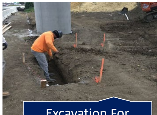
Excavation For Anchor Block