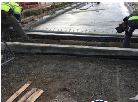
Joint Seal Installation