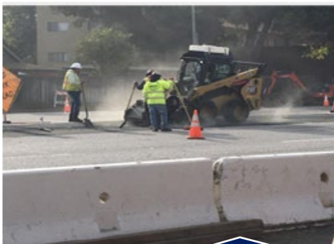
Grinding Out Pothole