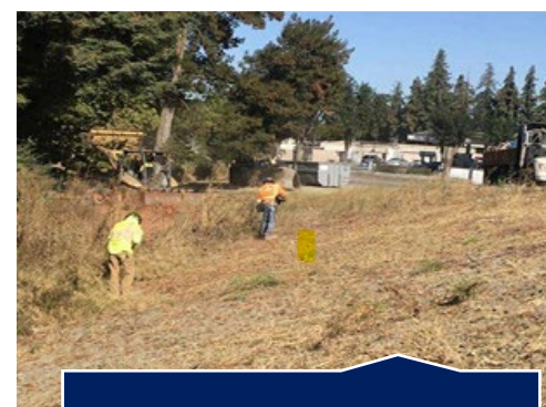
Project Site Cleanup