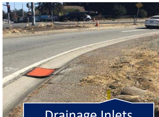
Drainage Inlets Clean and Covered