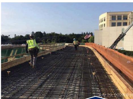
Deck Rebar Placement