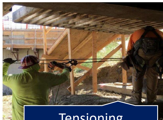
Tensioning Falsework Bracing